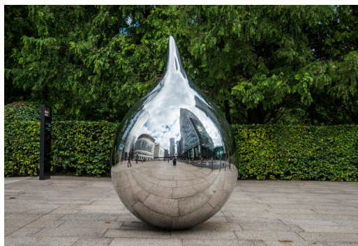
9. PERPETUAL RED Merete Rasmussen