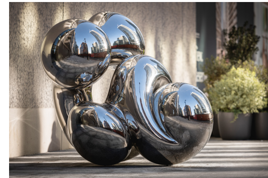
8. METAMORPHOSIS Helaine Blumenfeld