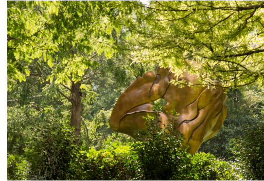
3. DRAWING CUBE Suresh Dutt