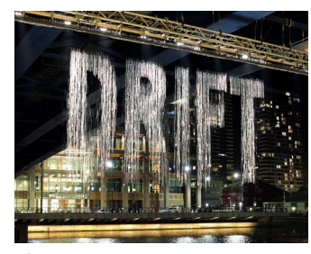
A Bit.fall by Julius Popp Chancellor Passage