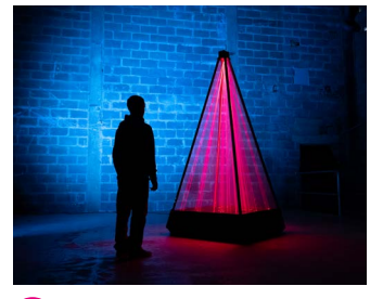
Vessels by Limbic Cinema Crossrail Place Roof Garden (West End)