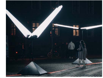
LES OISEAUX by Simon Chevalier Cabot Square