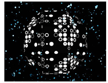
Geist by This is Loop Union Square