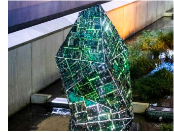
Elantica 'The Boulder' by Tom&Lien Dekyvere Crossrail Place, Level -1, Quayside

Canary Wharf is home to the UK's largest free to visit outdoor Public Art collection. Scan here to find out more.