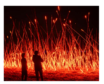
Sign by Vendel & De Wolf Westferry Circus