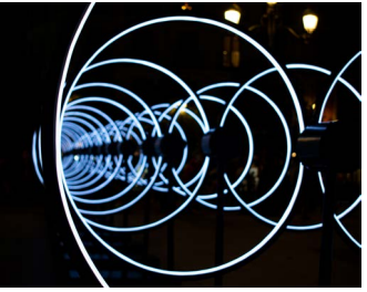
Kinetic Perspective by Juan Fuentes Water Street