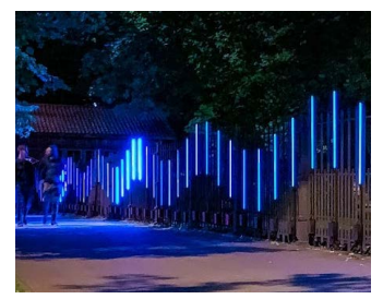
On the Wave of Light by Those Guys Lighting Riverside