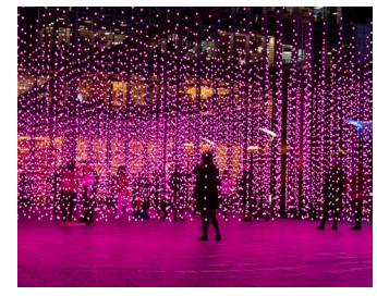
Submergence by Squidsoup Montgomery Square