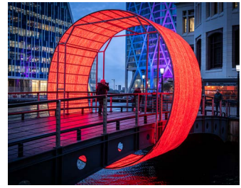
The Clew by Ottotto Cubitt Bridge