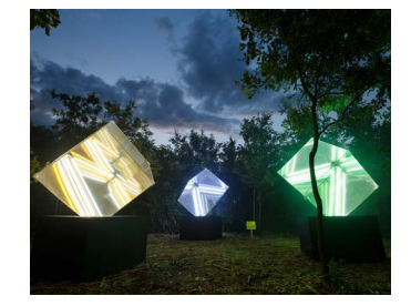
9 In-Between by Daniel Popescu Crossrail Place Roof Garden (East End)