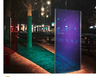
Shine Your Colours by Tine Bech Riverside