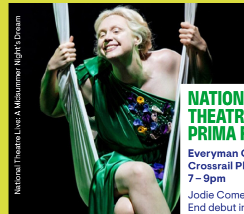
National Theatre Live: A Midsummer Night's Dream