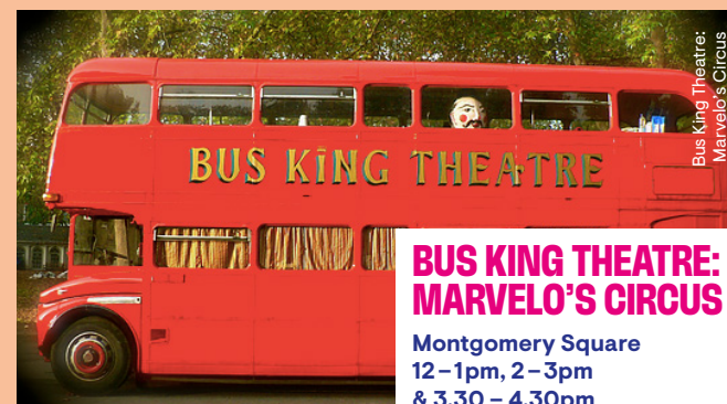
Bus King Theatre: Marvelo's Circus