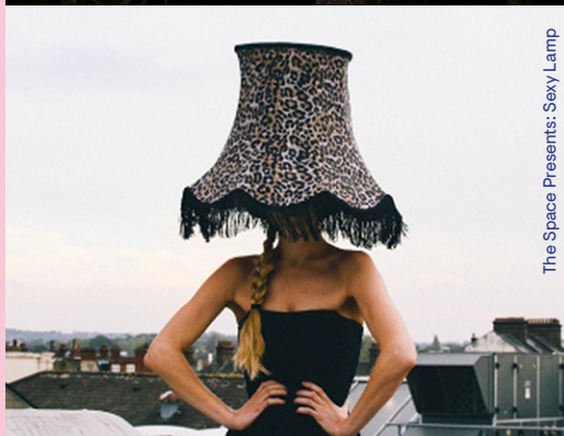
The Space Presents: Sexy Lamp