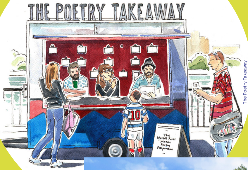
The Poetry Takeaway