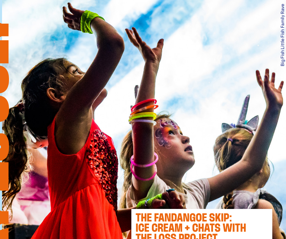
Big Fish Little Fish Family Rave