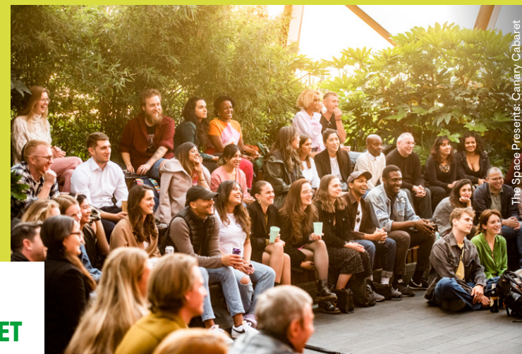
The Space Presents: Canary Cabaret