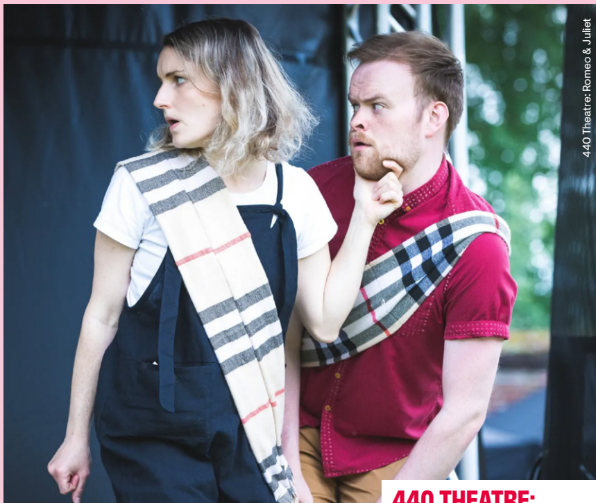
440 Theatre: Romeo & Juliet