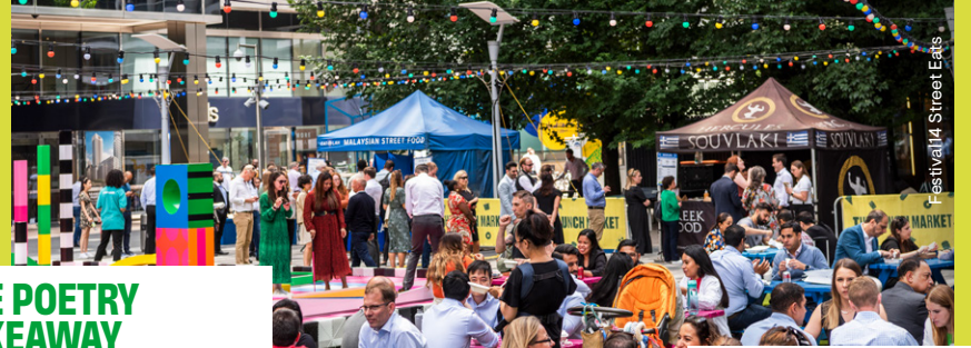
Festival14 Street Eats