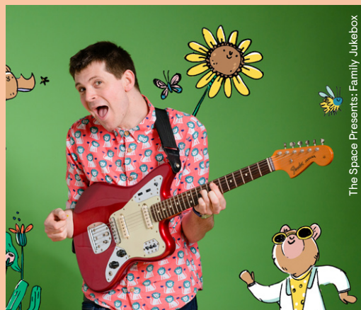
The Space Presents: Family Jukebox