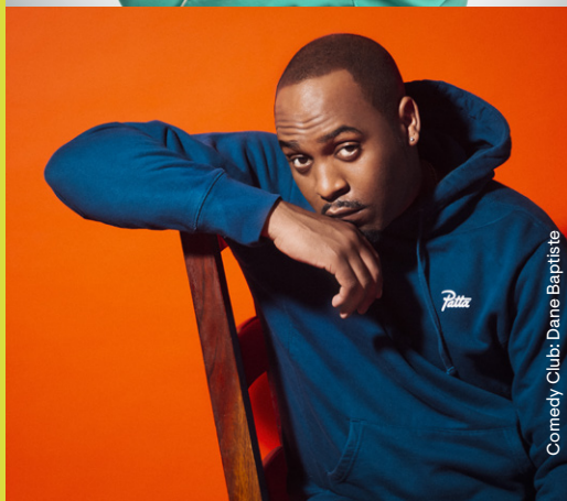
Comedy Club: Dane Baptiste