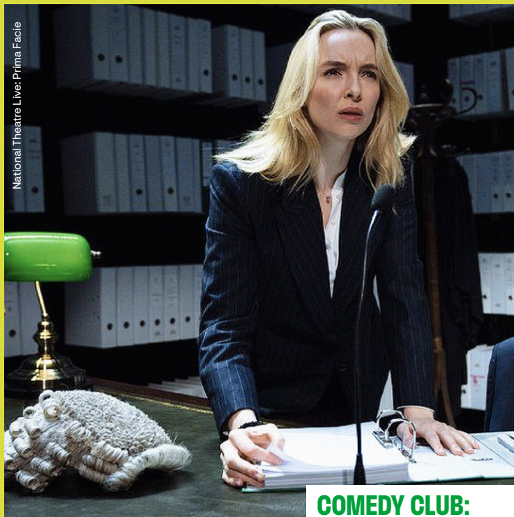
National Theatre Live: Prima Facie