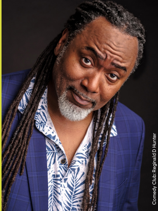
Comedy Club: Reginald D Hunter