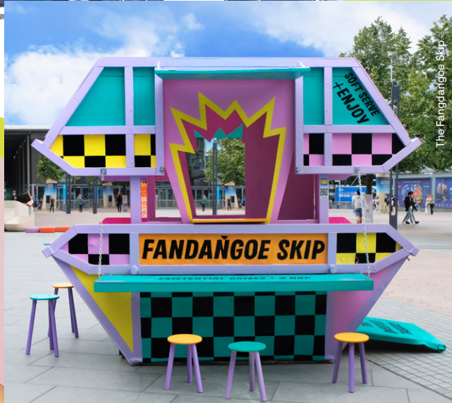
The Fandango Skip