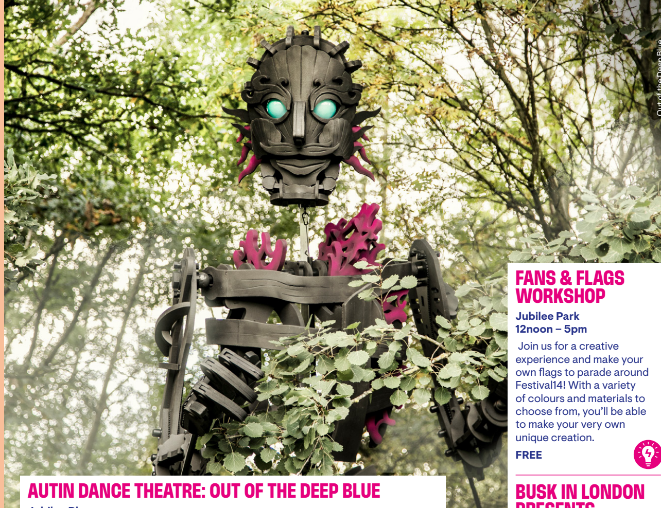
Out of the Deep Blue