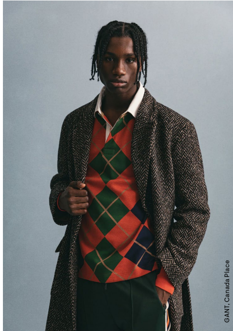
GANT, Canada Place

From small boutiques to designer labels across five spacious and immaculately appointed malls, shops span everything from beauty and fashion to fitness, homeware and more.