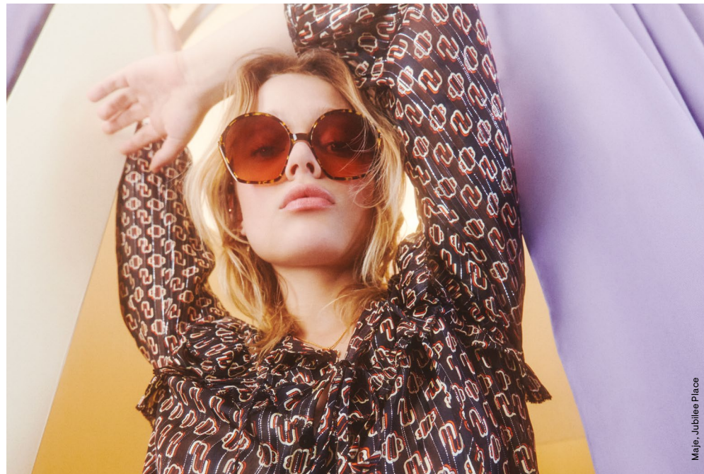
Maje, Jubilee Place